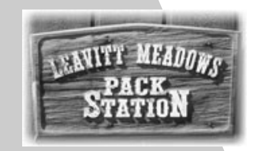
Remember to bring your camera!!!

Look through our web site and then call us to make your reservations. We look forward to serving you while in the High Sierras.