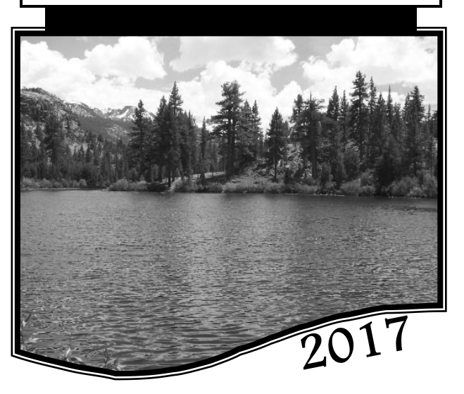
Something Most Folks Only Dream About...