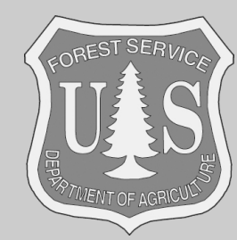
Under permit with the Humbolt/Toiyabe National Forest